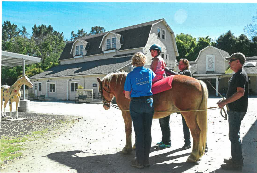
NCEFT therapy teams provide treatment and programs using horses to patients with a variety of physical and cognitive disabilities.